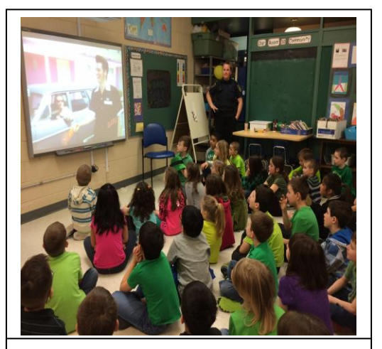
Constable Cain talks to grade threes about personal safety